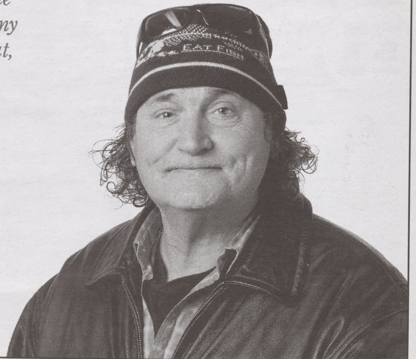
Rich Pounds Street Roots Vendor

"Street Roots means the ability to get back on my feet. It's not a hand out, but a hand up."