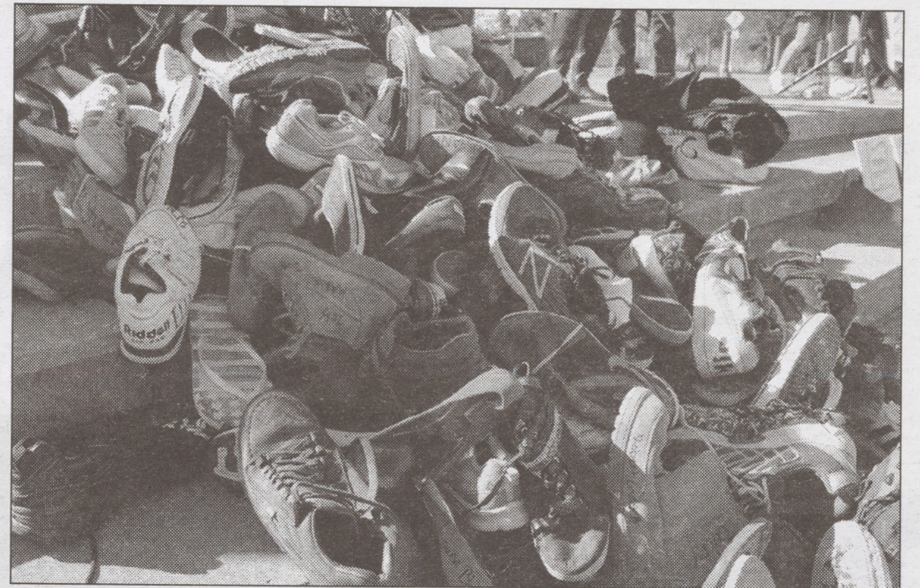
Each shoe placed outside the Capitol at the Oregon Recovers lobby day represents a life lost to addiction.