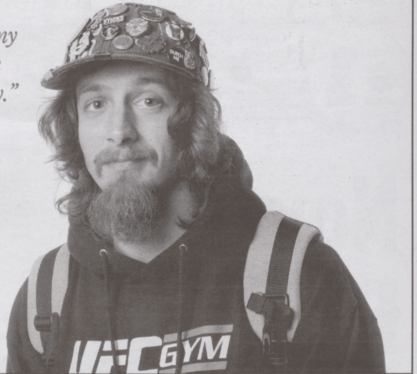
Shaggy Street Roots Vendor

"Street Roots is a positive way to start my morning and give me motivation for the day."