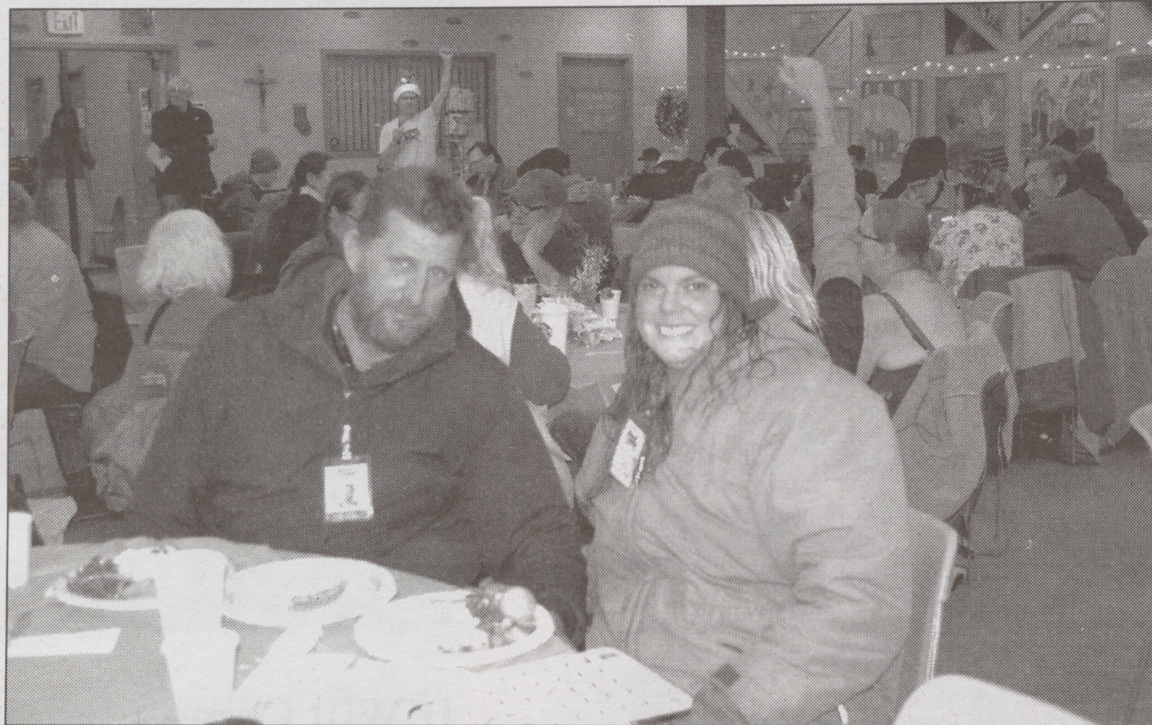
STREET ROOTS PHOTOS

The party was attended by Street Roots vendors, staff and volunteers. Twenty-two volunteers served food, handed out gifts and took photos. Much gratitude to all who made the party possible.