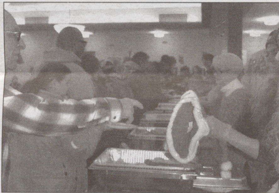
Volunteers serve a holiday meal to Street Roots vendors.