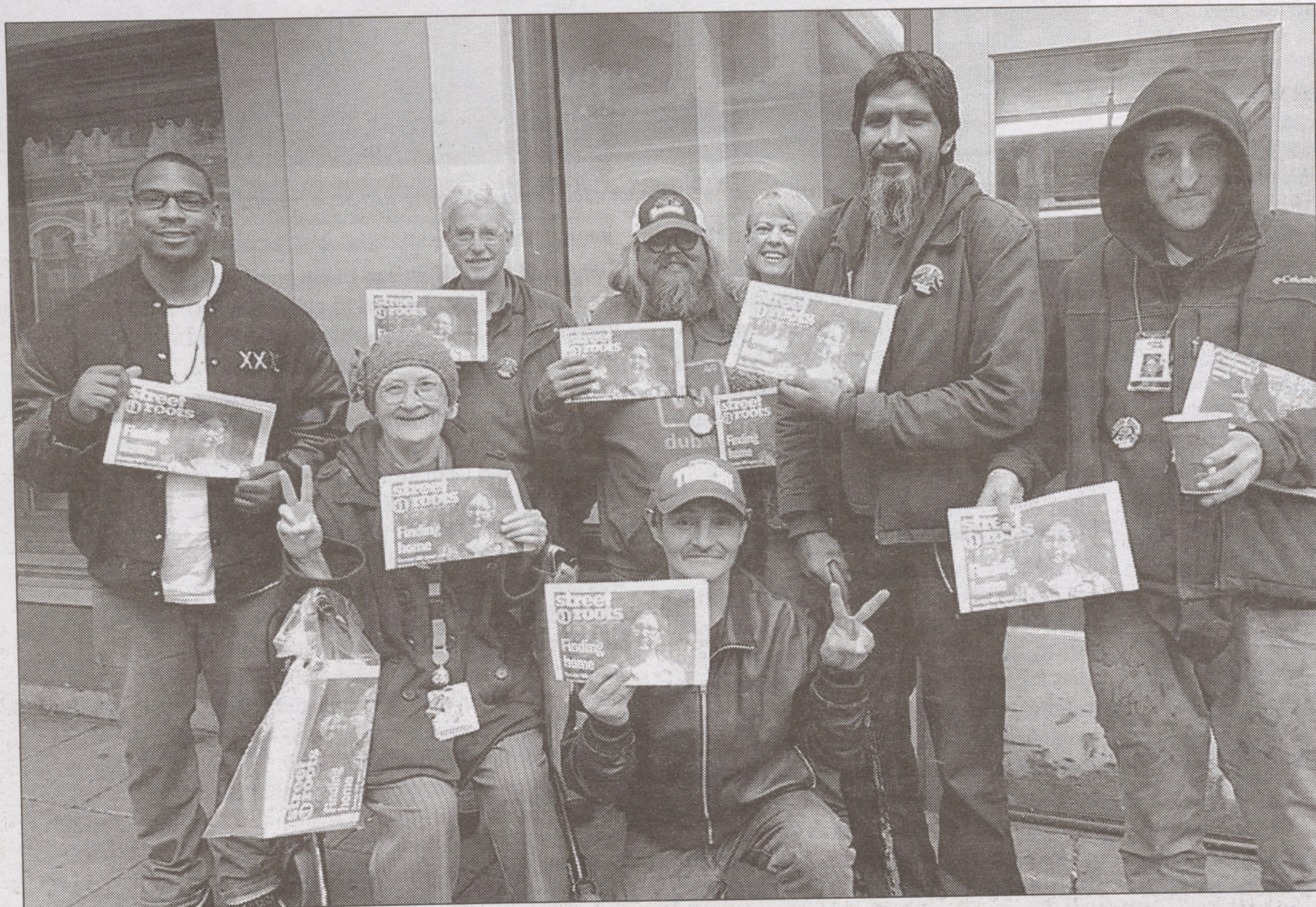
Street Roots vendors on a new paper day, every Friday at the Street Roots office.