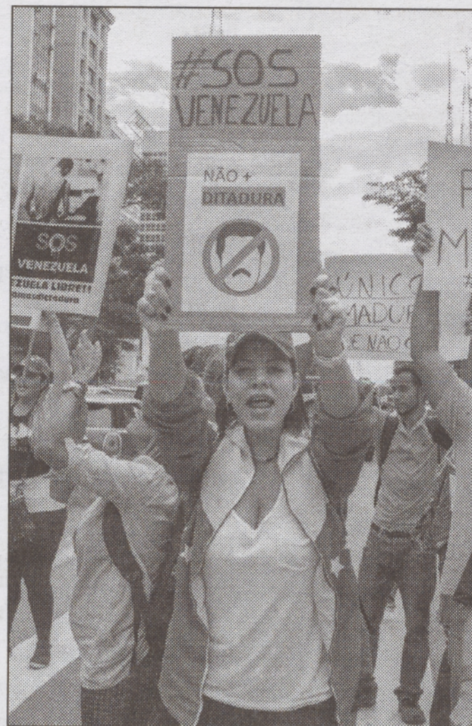
People in Sao Paulo, Brazil, turned out to protest Venezuela’s Bolivarian Revolution in May. Many leftist governments in South America are struggling.