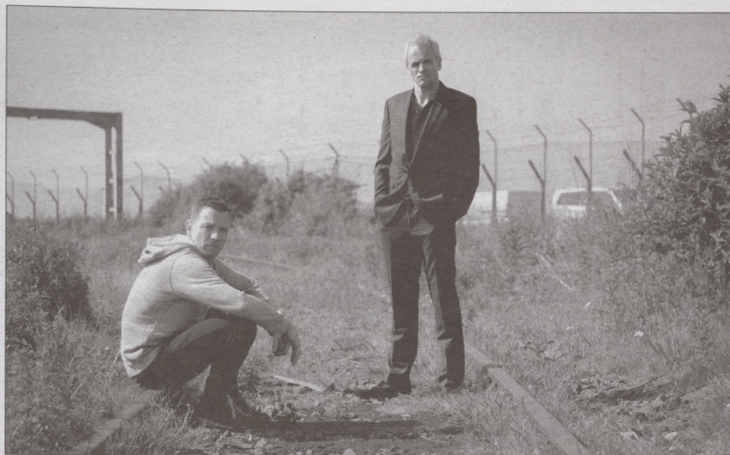
Ewan McGregor plays Mark Renton and Jonny Lee Miller plays Simon in "T2 Trainspotting."

"We're also doing this within a disintegrating society, a society that's falling apart, that can't afford to pay people wages. It's facing up to these big existential crises. It's such an interesting and vibrant place for all of this to play out. It's very hard to say that one movie