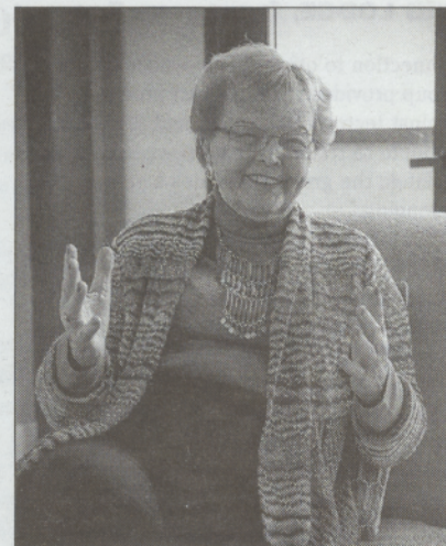
Gov. Barbara Roberts

- Barbara Roberts, former governor of Oregon and champion of the Death with Dignity Act Nov. 25