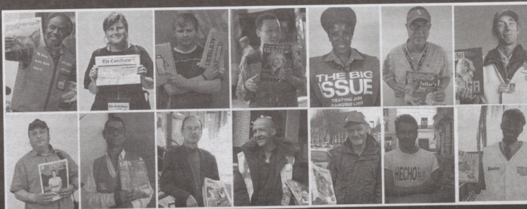
Street Roots is a proud member of the International Network of Street Papers, now more than 120 papers strong, worldwide.