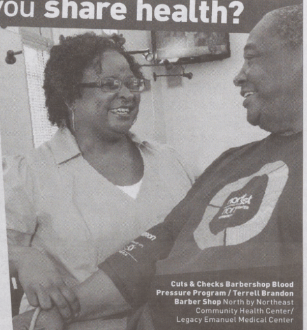
Cuts & Checks Barbershop Blood Pressure Program / Terrell Brandon Barber Shop North by Northeast Community Health Center/ Legacy Emanuel Medical Center