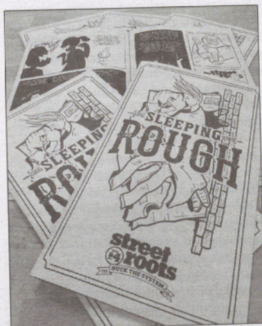
The new Street Roots zine hits the streets today. It's $4, with all proceeds going directly to your vendor.