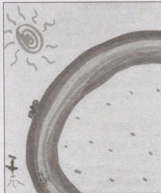
Ted Wheeler's daughter drew springtime in Portland.

I will work to increase the percentage of minority- and women-owned businesses that receive public contracts.