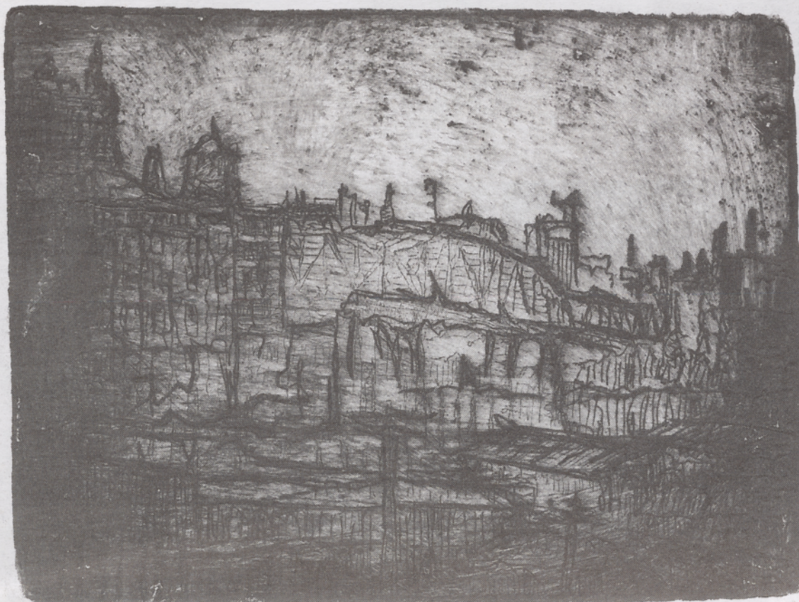
ARTWORK BY ALEX LILLY