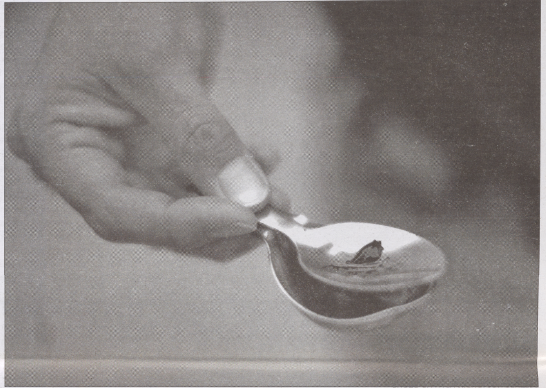
Black tar heroin from Mexico has been linked to an increasing number of deaths in the United States.

Sam Quinones: Years ago I was a crime reporter in Stockton, Calif., and one thing I learned about was black tar heroin because the local cops and the DEA told me that heroin in the Western United States always came from Mexico and was only black tar. I went down to Mexico after working in Stockton. When I was down there, I did a lot of study of and writing about immigration. So that was part of my background when I did the story. After living in Mexico, I went back to the United States and I was placed