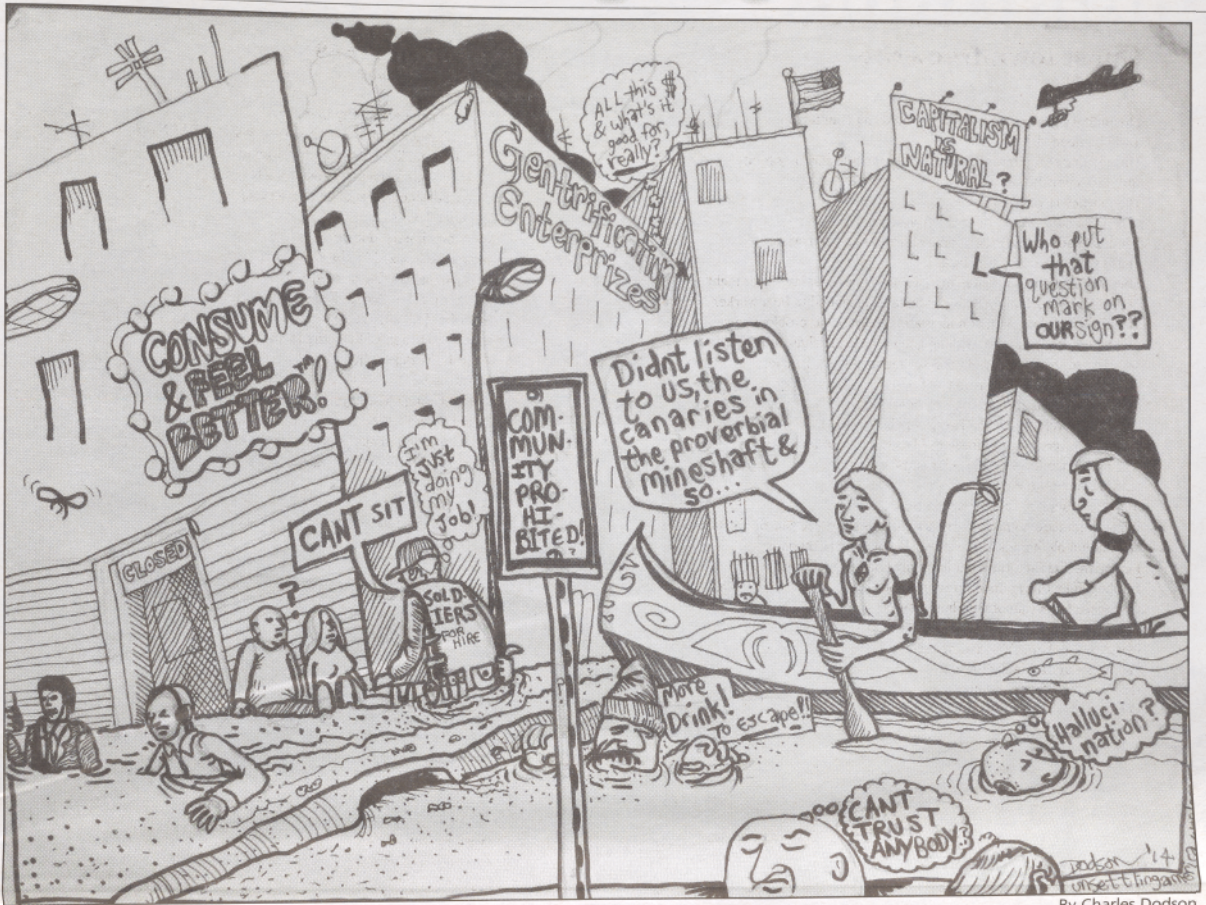
By Charles Dodson