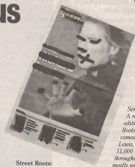
Seriously? A redacted edition of Street Roots featuring comedian Richard Lewis, one of nearly 11,000 copies distributed throughout Portland, mostly unredacted.