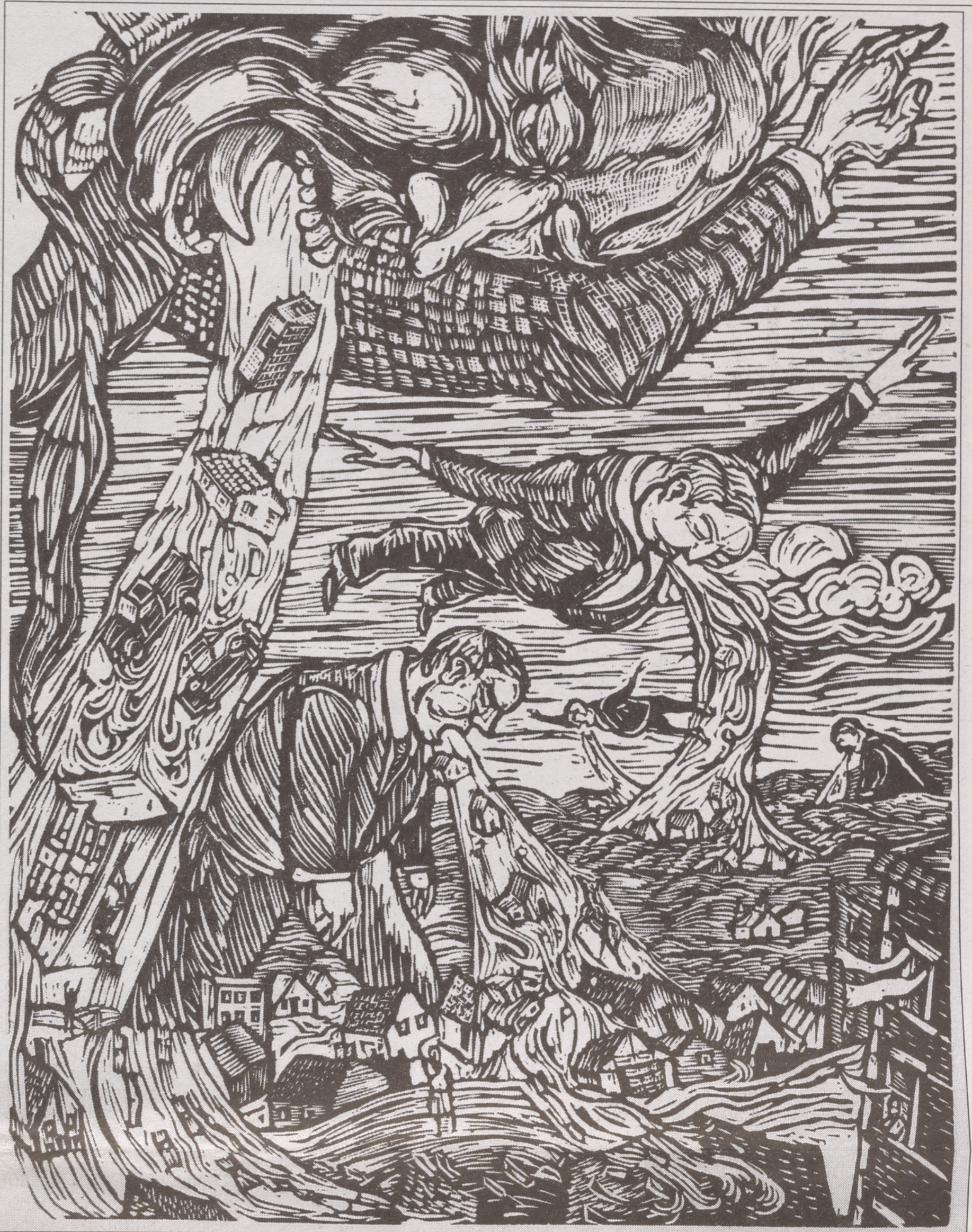
By Art Hazelwood

The food is better here, they said The food is more interesting In the dark places of the mind Where one first ponders the Availability of the fruit Wonders that there is fruit at all Apples or oranges or bananas We eat like bats do, Then we ponder organics until, Distracted by lack of bananas, We eat the apples – the green apples Of unusual size