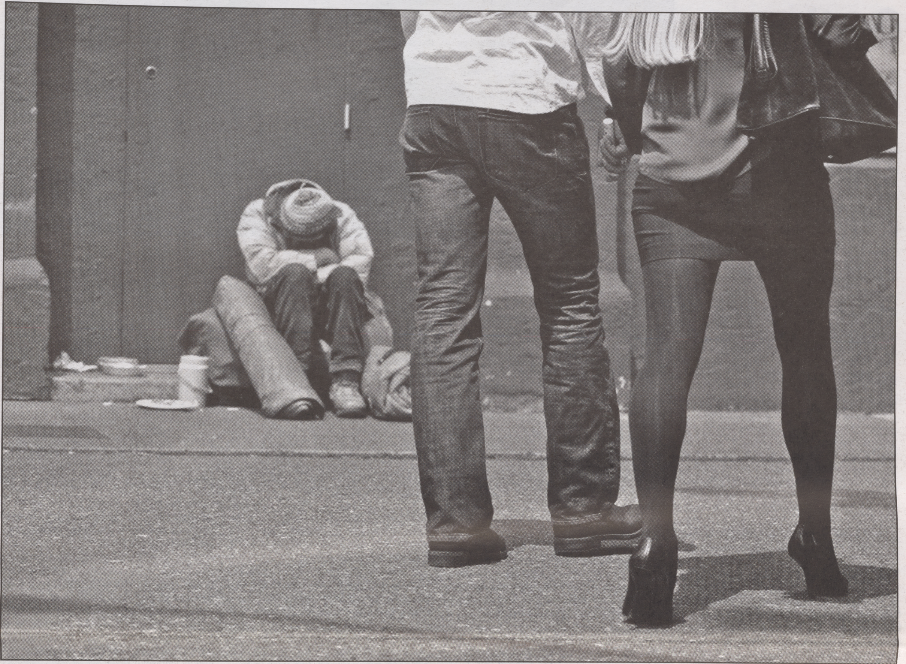
A couple walk by a homeless person in downtown Portland. Photo is entitled, "Love and defeat."