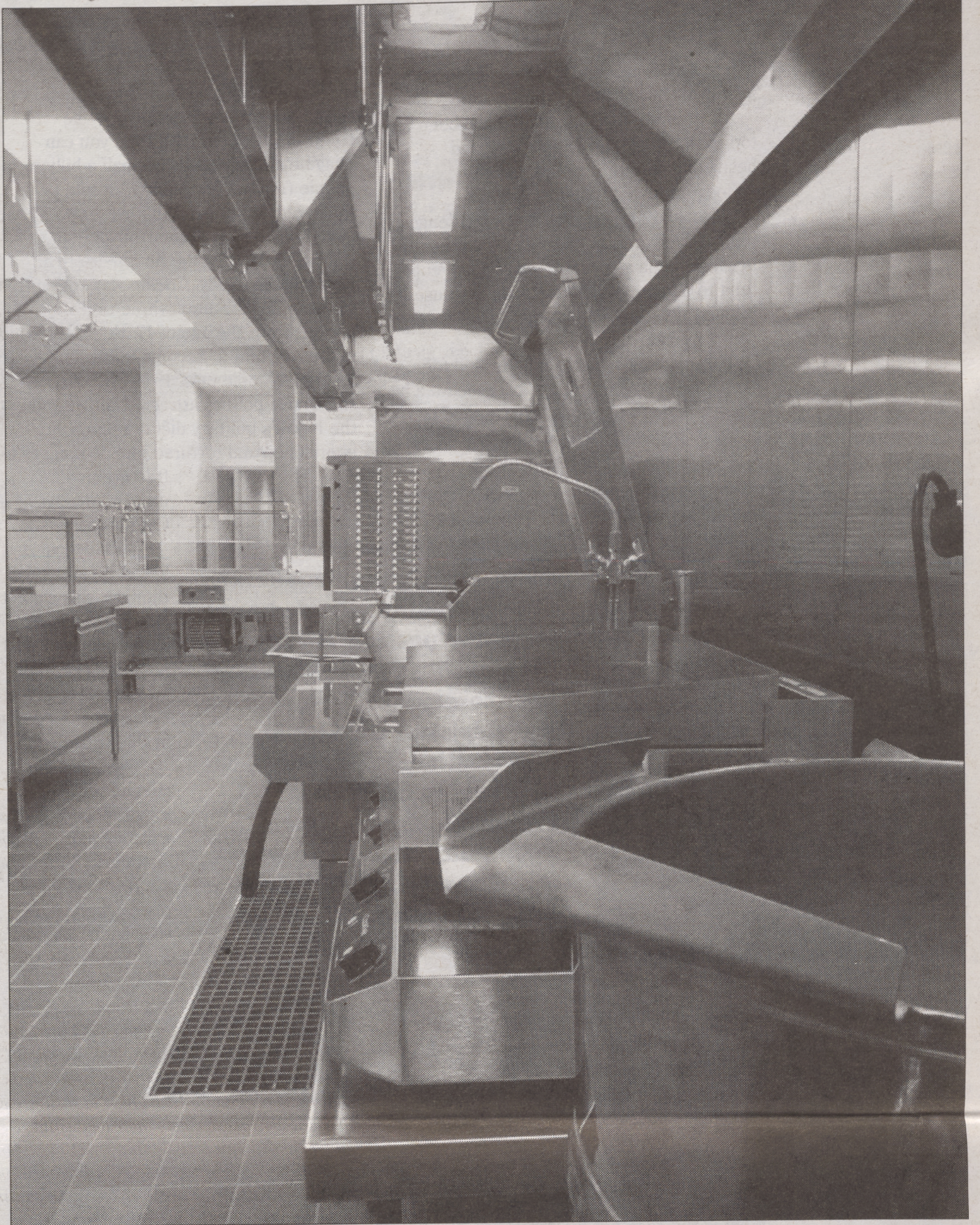
Above top, the new Blanchet House of Hospitality exterior. The new commercial kitchen facility. Lower right, many of the furnishings in the rooms were built by residents at the organization's woodworking shop in Yamhill County.

The new facility is in part a hands-on project for its program participants. Residents working in the organization's wood shop, located on the farm, made much of the furniture in the new center, including the tables and stools for the dining hall, and dressers, desks and nightstands for the rooms upstairs.