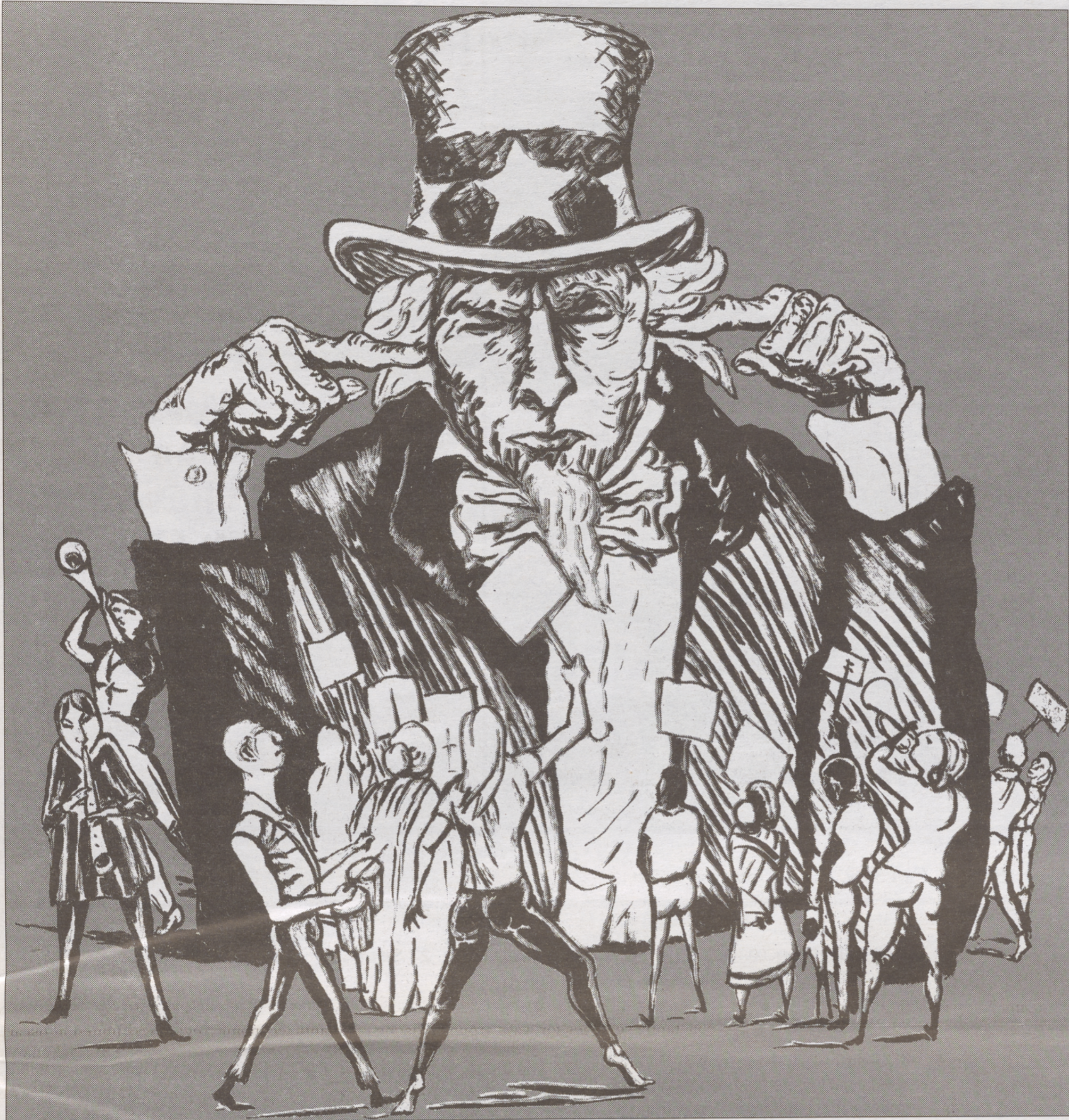
By Art Hazelwood