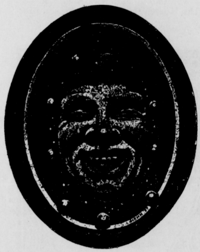
The Holy Modal Rounders @ the Crystal Ballroom in Portland, 14 th and Burnside, Saturday, Jan. 6 th 2001 AD