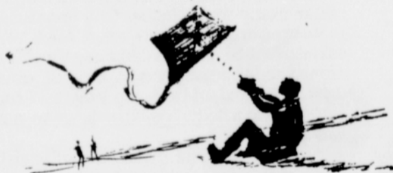
Kite Flying...the villagers opt for personal wind craft constructed of heavy canvas and galvanized pipe.