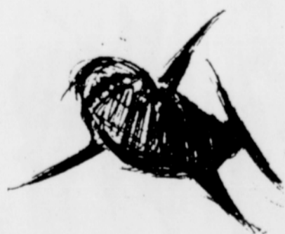
The Shark.....There are no happy shark stories...