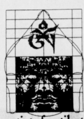
artists for tibet

ALL PROCEEDS TO BENEFIT THE TIBETAN CAUSE FOR ADDITIONAL INFO: RHONDA KENNEDY 503 233 7055