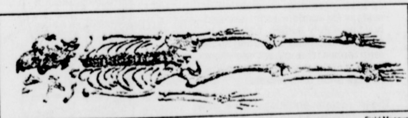
This woman was 18 years old and had had at least one child when she died approximately 15,000 years ago in Cap Blanc, France.

"In raw numbers," notes conservative thinker Charles Murray, "European-American whites are the ethnic group with the most people in poverty, most illegitimate children, most women on welfare, most unemployed men, and most arrests for serious crimes."