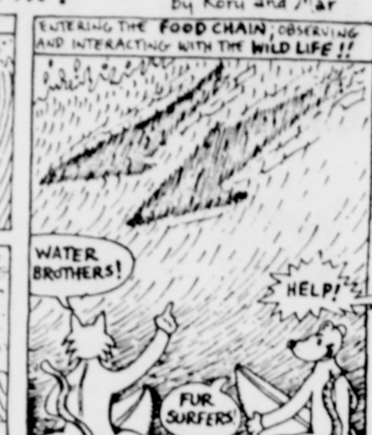
ENTERING THE FOOD CHAIN, OBSERVING AND INTERACTING WITH THE WILD LIFE!!