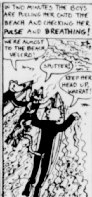
IN TWO MINUTES THE BOYS ARE PULLING HER CATCHED THE BEACH AND CHECKING HER PULSE AND BREATHING!