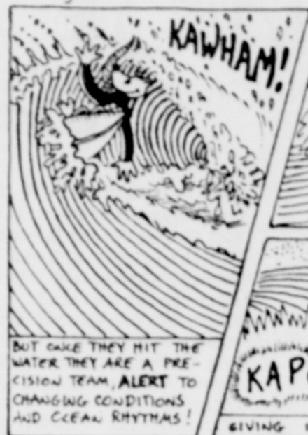
BUT WHEN THEY HIT THE WATER THEY ARE A PRECISION TEAM, ALERT TO CHANGING CONDITIONS AND OCEAN RHYTHMS!