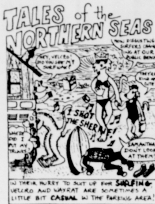
IN THEIR HURRY TO SUIT UP FOR SURFING, VELCRO AND WAYRAT ARE SOMETIMES A LITTLE BIT CASUAL IN THE PARKING AREA!

310 Lake St • P.O. Box 72, Ilwaco, WA 98124 (206) 642-4266