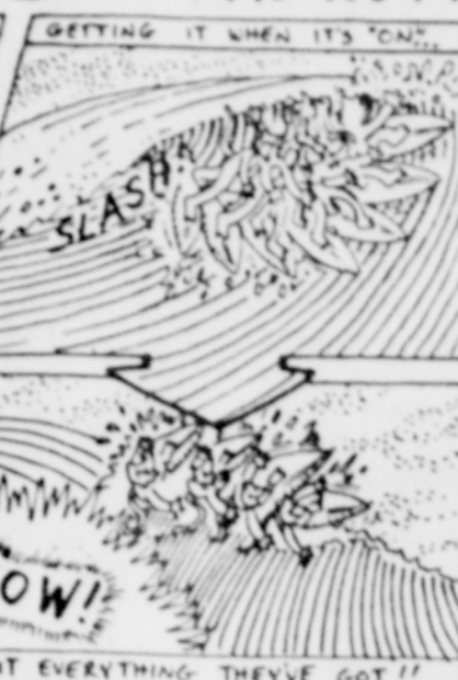
GIVING IT EVERYTHING THEYVE GOT!!