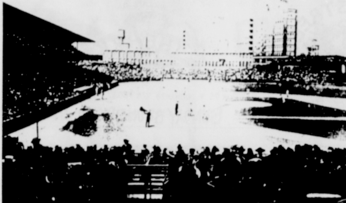
Baker Bowl , Philadelphia - Fatal accidents due to collapsing grandstands occurred here. Twice.

Next Month: The strike; The victims, The passers-by, and The Lynch List.