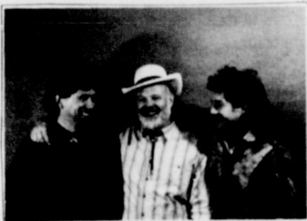
The Mighty Eagles Sunday afternoon at Camp Union Station Sunday May 28th 5 p.m.