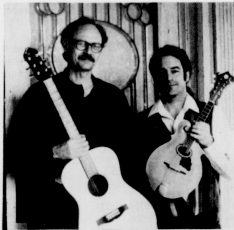
Crabo & Spud