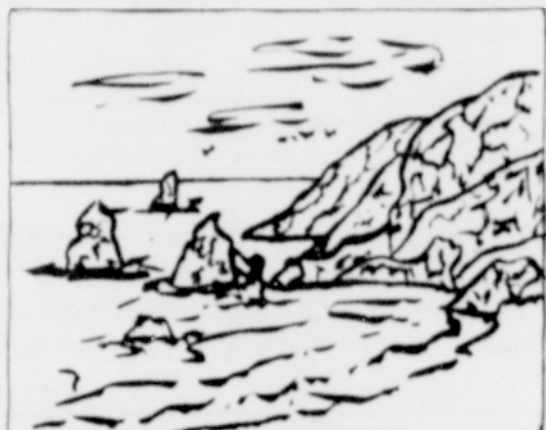
Silver Point Studio PO Box 699, Cannon Beach Oregon 97110 Joseph E. Brown

original handmade tiles architectural ceramics commissions murals Neskowin 592 4197