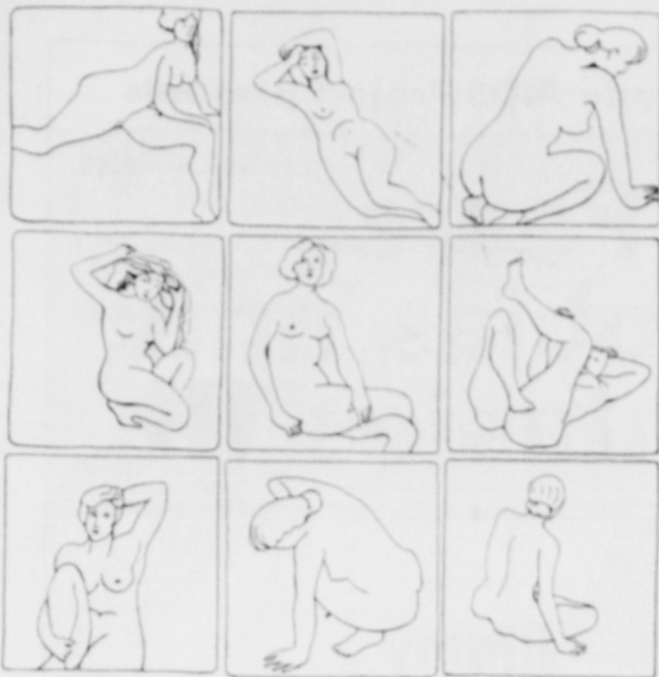
WOMAN SERIES FALK TILE 646