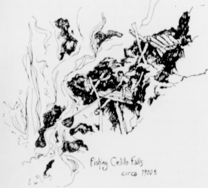
Fishing Celilo Falls circa 1900's

As any Great White Father in Washington will tell you, when you're dealing with the treaty rights established in 1855, timing is everything.