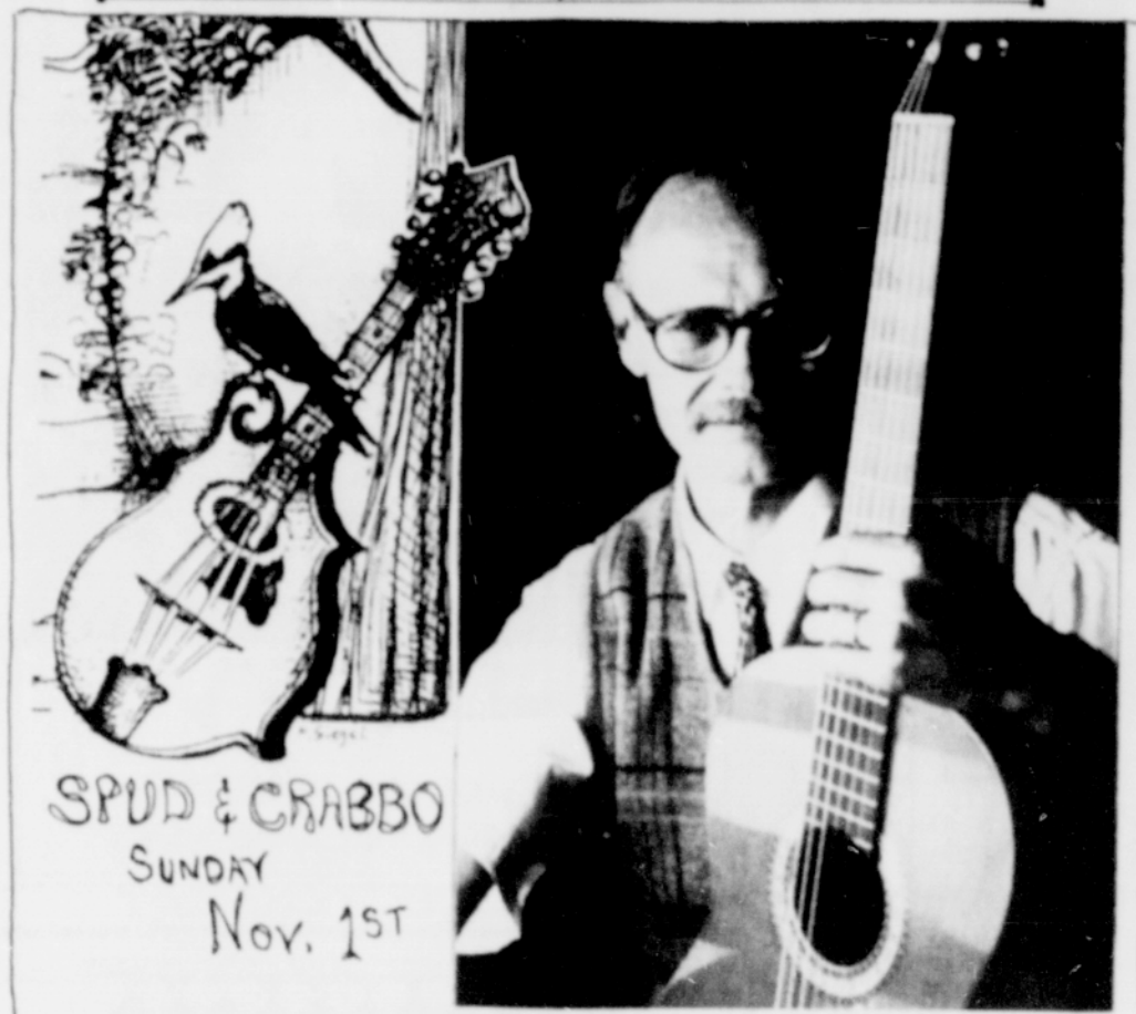
SPUD & CRABBO SUNDAY Nov. 1ST