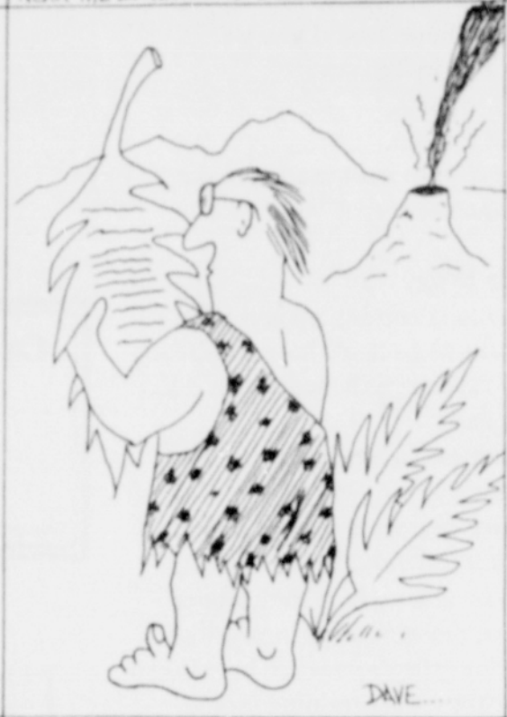
EARLY PALM READER