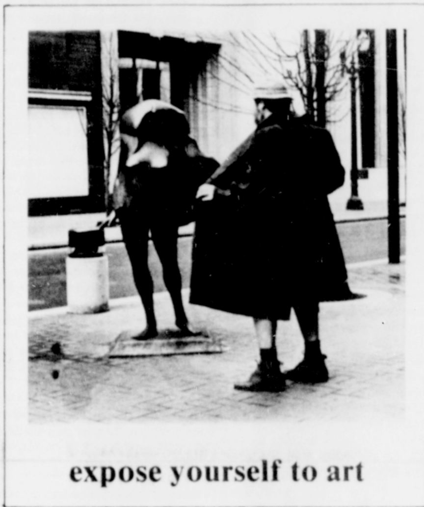
expose yourself to art

Hon. J.E. "Bud" Clark, retiring Mayor of Portland, Or.