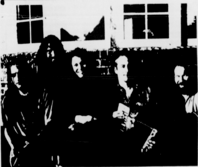
SATURDAY, JULY 18 TH BOND STREET BLUES BAND BLUES, OBVIOUSLY