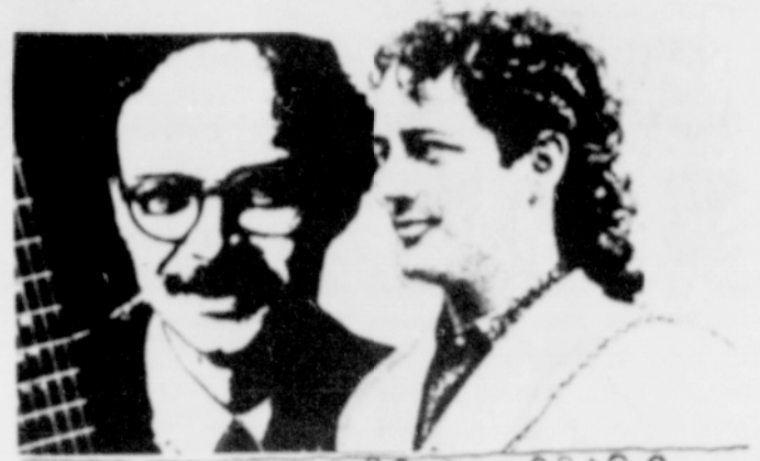
SUNDAY JULY 5 TH SPUD & CRABO