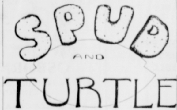
AGAIN SUNDAY JULY 26 TH