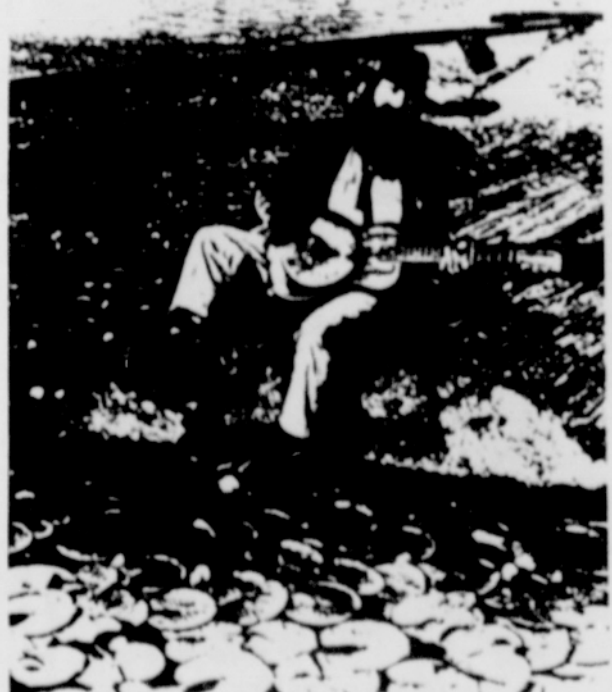
BABY GRAMPS SATURDAY JULY 25 TH CARTOON & FOLK