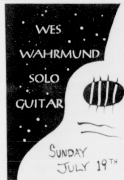
SUNDAY JULY 19 TH