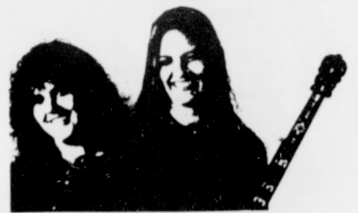
SUNDAY JULY 12 TH Clismaclaver