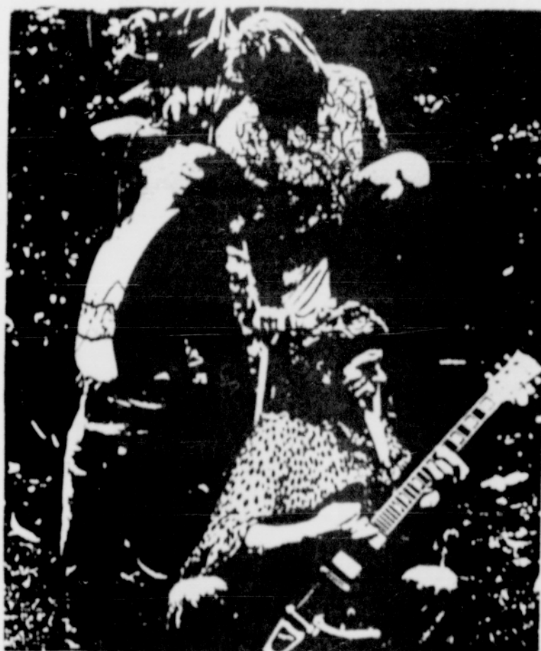
APRIL 23 • PAGAN PANCAKES