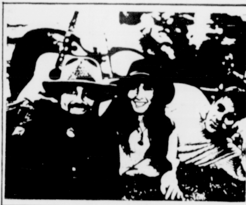
APRIL 30 • DREAMTIME

Astoria's favorites, ours too, "The Marx Brothers play Rock and Roll."