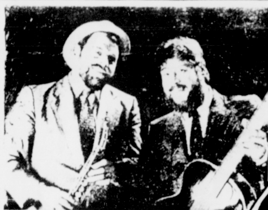
APRIL 9 • JOHNNY & THE JOKERS