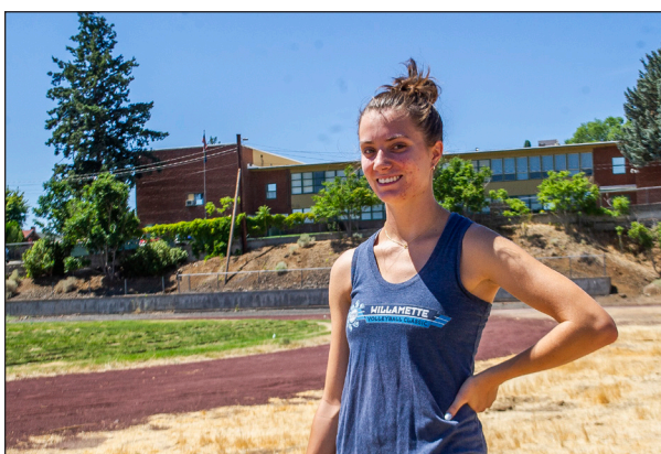
Maupin to receive new state-of-the-art athletic track— A12

Mid-80s to low-90s through the week in the Gorge. Sunny and pleasant weather.