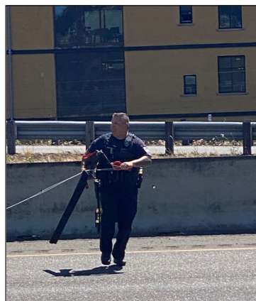
An officer sets a spike strip in hopes of disabling a vehicle fleeing westbound on Interstate 84 in Hood River. The vehicle instead fled into Washington.

The women's 4x200 meter freestyle relay races are scheduled to begin on July 28 and the finals will take place the following day, July 29.