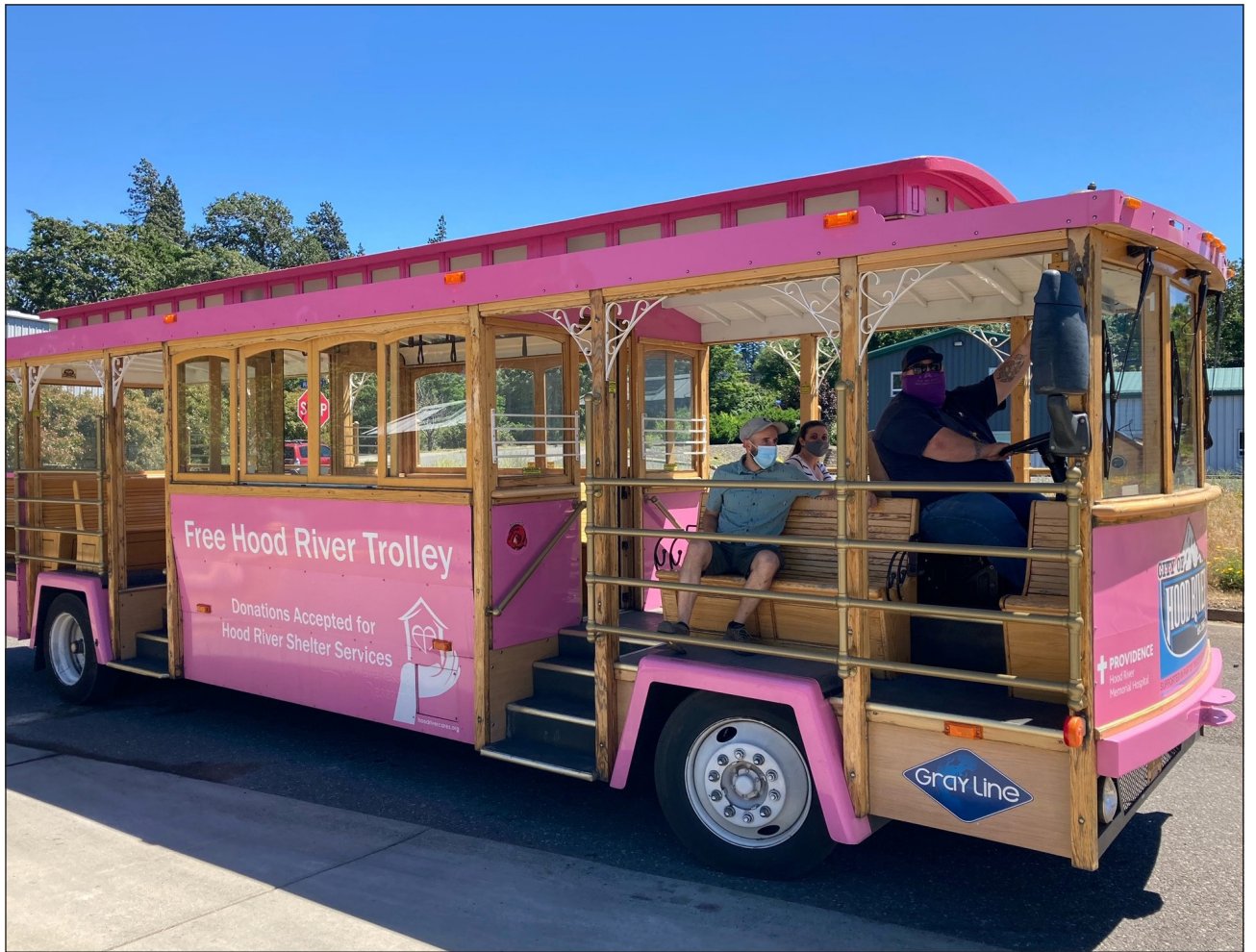
The Hood River Trolley is back again this summer, with free passes for Gorge residents who meet poverty guidelines or work downtown.

Gorge bus passes provide access to in-city routes on buses weekdays and weekends and on trolleys weekends.