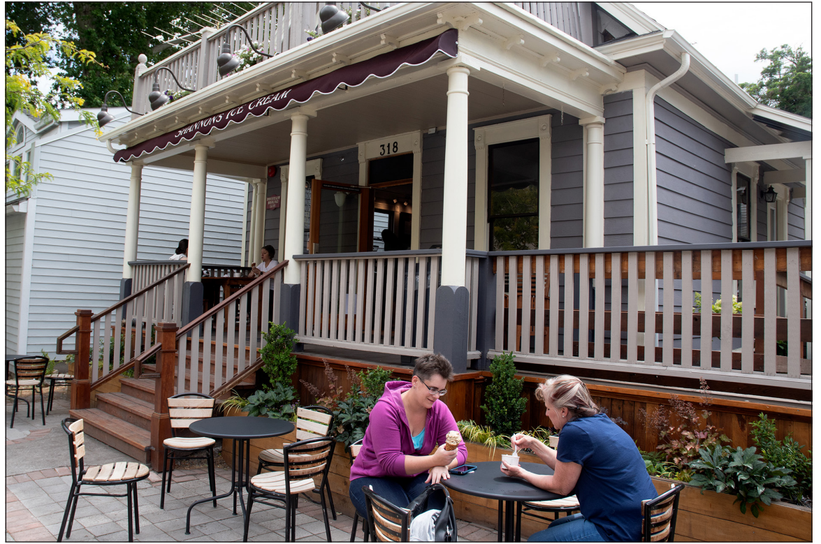
A pair of customers enjoys ice cream on Friday, June 11, outside of Shannon's Ice Cream on E. Fourth Street in The Dalles.

our pants operation, but like, cool things have just appeared right when we need them, so we kind of figure that's going to happen with employees too. The right person is going to show up like Mary Poppins."