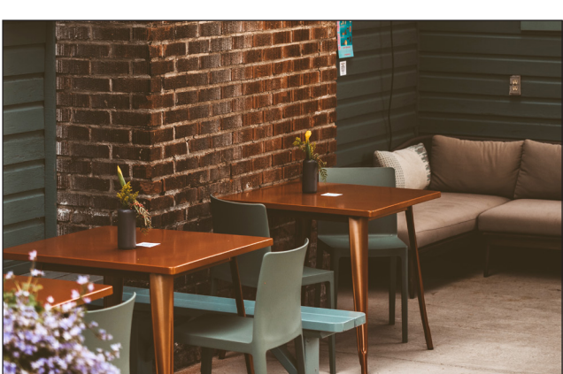
An outdoor seating area is arranged around the exterior brick fireplace at Hood River Common House. At right, a guest laughs in the indoor seating area.

want to build the business around COVID, but the flow is important to us," McKinley said. In addition to the inside space, the outside of the building facing Fifth Street has been reconfigured into an additional seating area.