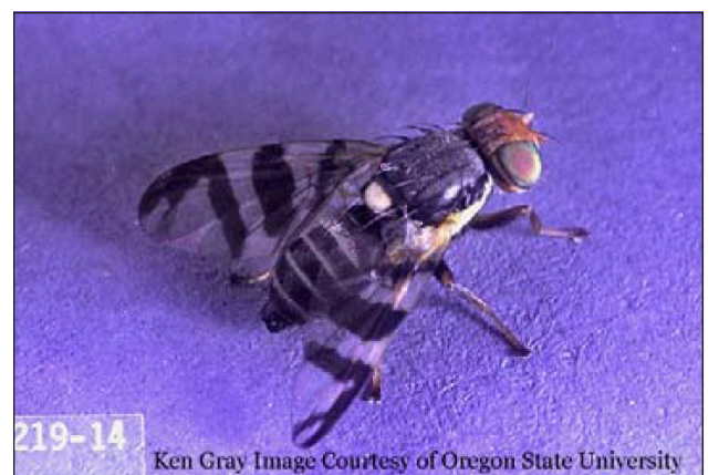
Adult Western Cherry Fruit Fly, above, and worm, at right.

The cherry fruit fly overwinters in a cocoon as a