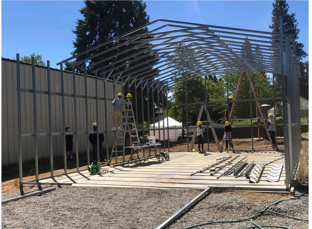
Students learn construction skills building a new outbuilding at the high school. Outdoor and experiential learning will be featured during the HRVHS Summer Program. Contributed photo