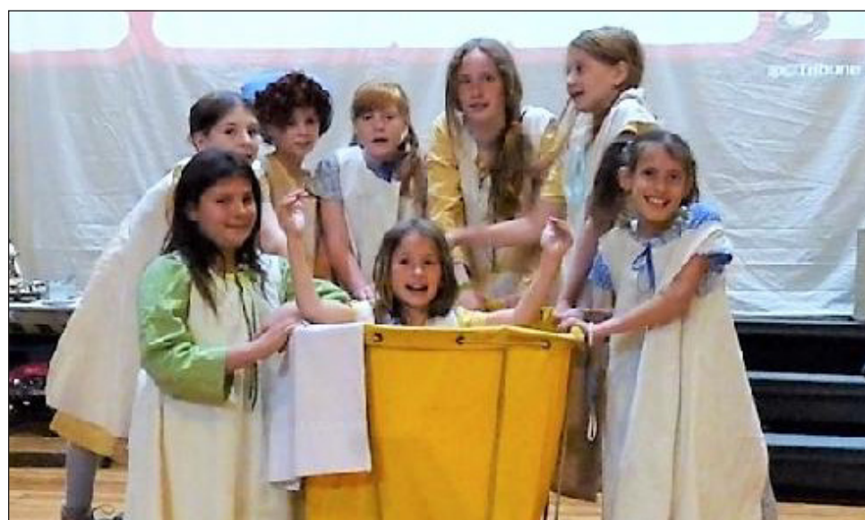
Annie Jr., a children's play based on the comic strip Little Orphan Annie, will be performed at The Dalles Civic Auditorium beginning June 18.

contracts ■ Complete study and establish new toll structure ■ Acquire rights of way Phase 4 (2026) ■ Construction begins.