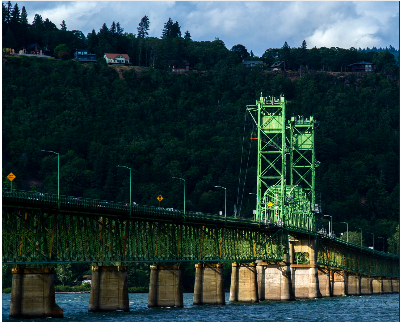
The lift span of the Hood River bridge is lit by a beam of sun Thursday, May 27. Plans for replacement of the bridge continue.