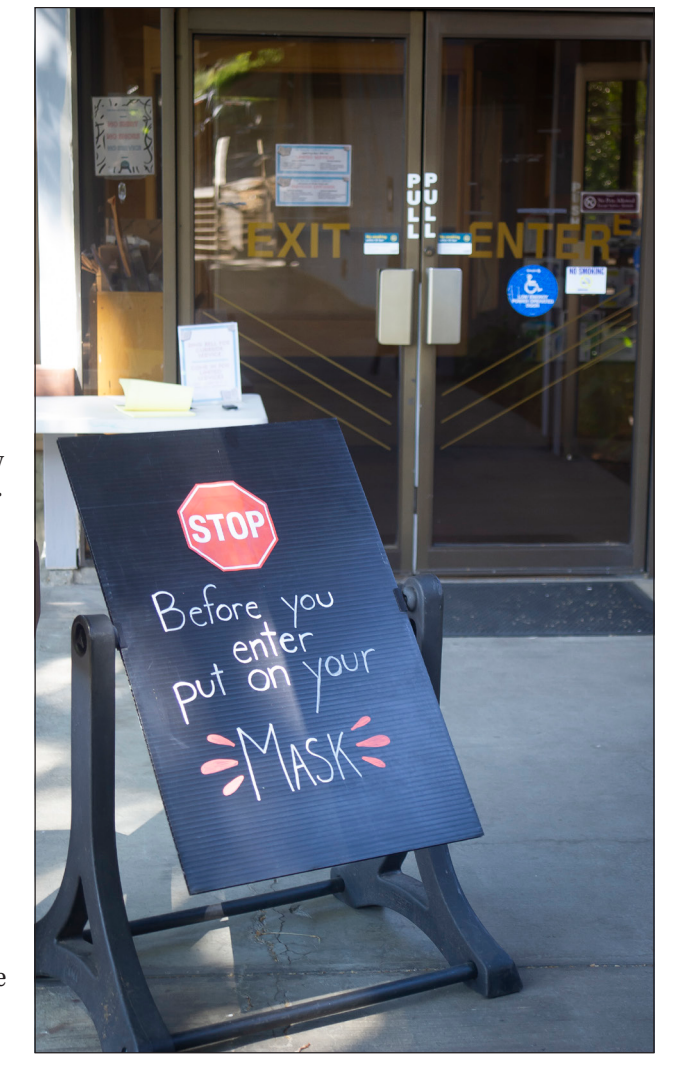
A sign at the entrance requests patrons to mask up before entering The Dalles-Wasco County library.

While in-person library programs, such as sewing, manga/anime, and knitting clubs are on hiatus for the time being, the library has had the opportunity to become innovative by providing the community with projects and entertainment for those who desire to participate. "Take and Make" bags, filled with all the required supplies needed to make a craft or participate in a STEM related activity, are available to patrons of any age and can be taken home and put together by individuals or with their families (each bag has video instructions that can be found on The Dalles Public Library YouTube channel). Patrons can also tune into children's Storytime, an interactive