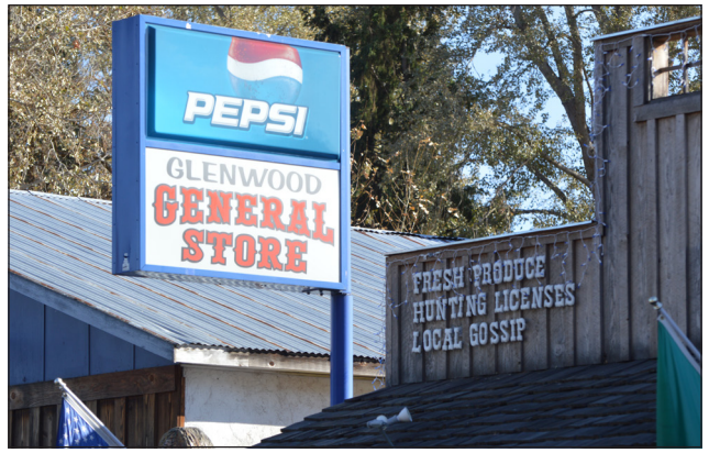
Have you heard? Glenwood General Store offers truth in advertising.