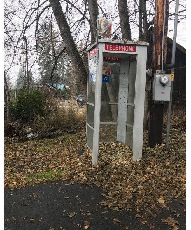
Trout Lake: Long-abandoned phone booth mostly catches leaves now.