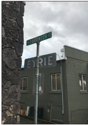
Who knows where the "Eyrie" is behind this sign in downtown White Salmon?