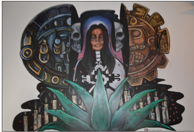
Pixan: Chrisforo Devart of White Salmon painted this centerpiece art displayed in the White Salmon taqueria.