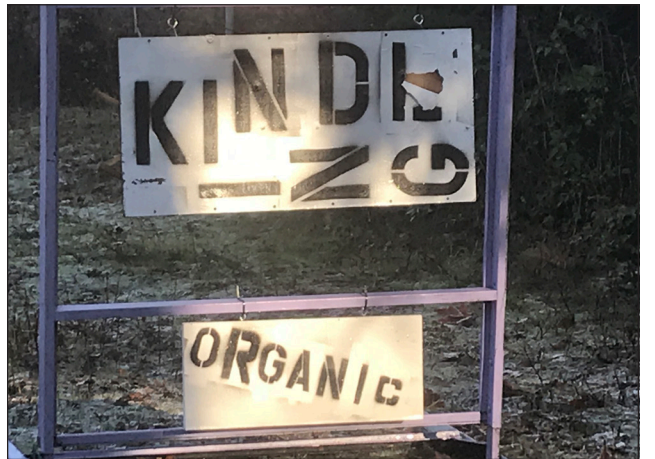
Dee Highway firewood sign, phrased to fit.

WELL SAID: "Democracy is the most difficult of all forms of government since it requires the widest spread of intelligence." — Historian Ariel Durant