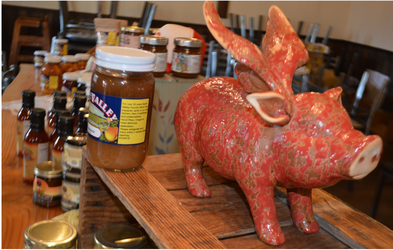
Pig-on-the-wing figurine, a near-twin of the Apple Valley BBQ symbol, was donated anonymously to the Parkdale restaurant last fall.