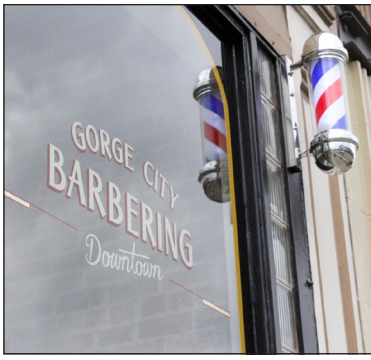
Gorge City Barbering has relocated from their shop on Sixth Street to 205 E. Second Street in The Dalles.