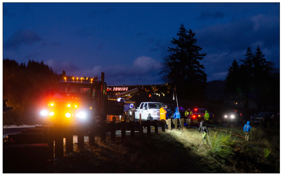
Skamania County first responders work to recover the vehicle and body of a local man in Underwood on Monday, Feb. 22 after a fatal crash.

Feb. 23 — Second and Hostetler — Male reported to be standing in the middle of the railroad tracks by two