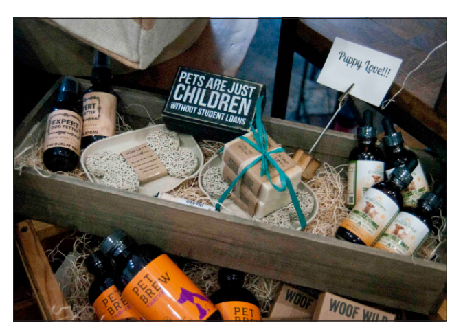
Nobody is left out at Herbal Revival Apothecary, where herb infused items of all sorts can be found, like those above designed for pets.

She settled on curbside pickups as the best compromise. And as the pandemic dragged on, with nervous shoppers needing curbside delivery or avoiding retail stores altogether, Ryan came up with a second pandemic-proof strategy — monthly subscription boxes, each offering a variety of unique and carefully integrated