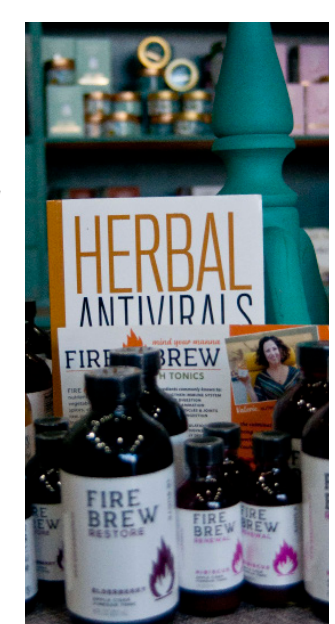
Herbal antivirals are among the items available.

In addition to herbal products, she carries a full selection of environmentally-friendly cleaning products as part of a "refill" station, allowing reuse of dispensers. These include hand and dish soap, laundry detergent and