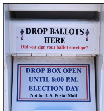
A drop box in Bingen awaits ballots for the Aug. 4 primary election in Washington. Preliminary results will be made available online.