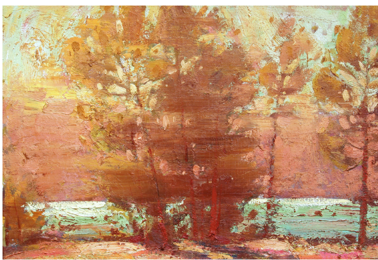
Plein Air exhibit opens for August.

WEATHER MOSTLY SUNNY, HIGHS IN LOW-80S, NIGHTTIME LOWS IN THE 50S