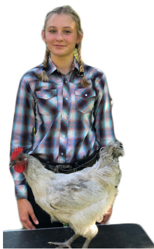
4-H, FFA have 'little piece of the fair'