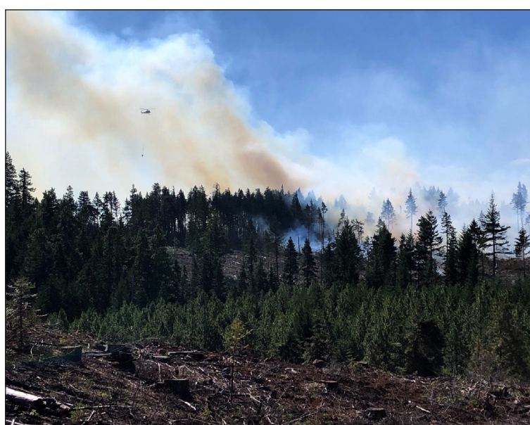
A helicopter with a bucket works the Fir Mountain Road fire southeast of Hood River Sunday, Aug. 2, 2020. The Dalles Unit of the Oregon Department of Forestry is the lead agency on the fire.