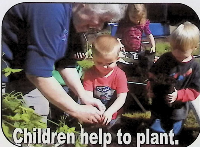
Children help to plant.

Last year The Carpenter Foundation gave us a grant to support parents and community members in building a Natural Playground. My dream is slowly taking shape.