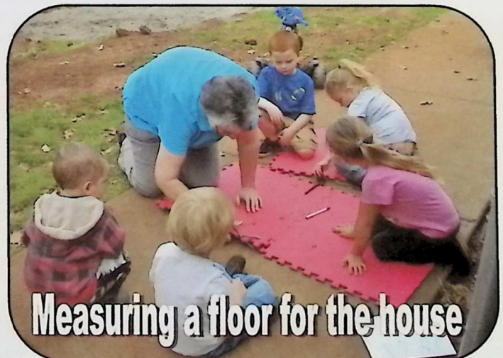
Measuring a floor for the house