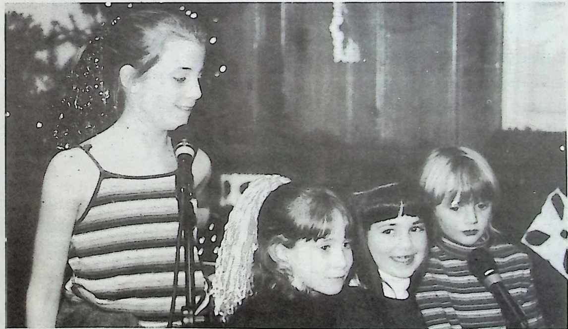
A SPECIAL PRESENTATION BY SOME CUTIES...