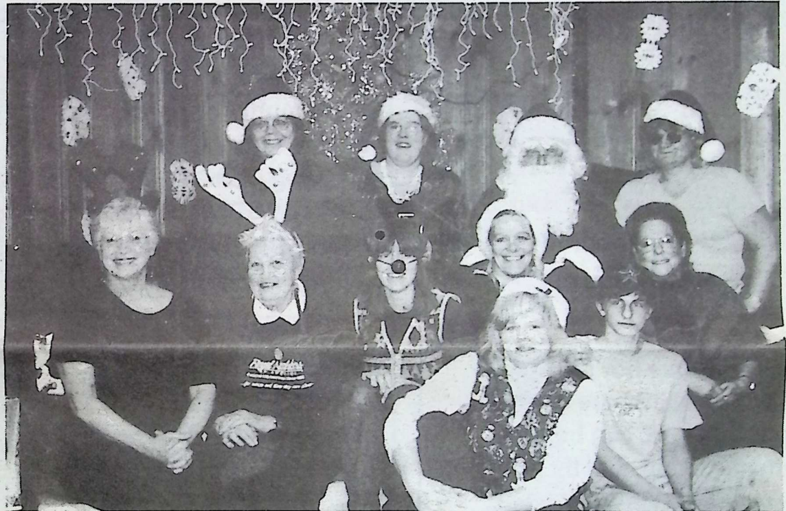
MANY OF THE HELPERS FOR THE EVENING