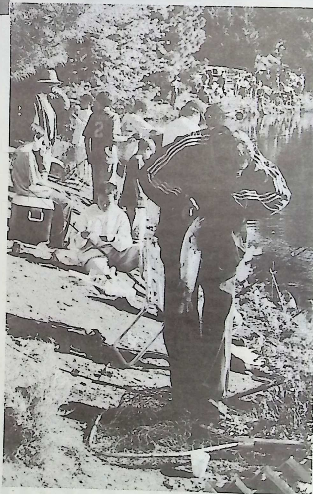
Kids Fishing Derby at Medco Ponds

Hope you all have a happy and successful new year. Good luck on your fishing. P.S. --- So Renee, would you like me to show you how to catch some bit trout?