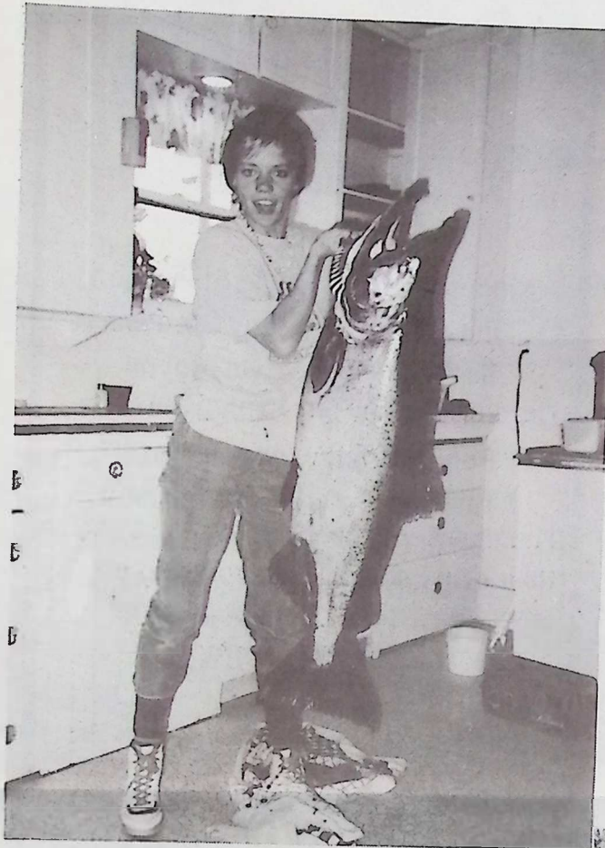
Who wears the waders in this family?